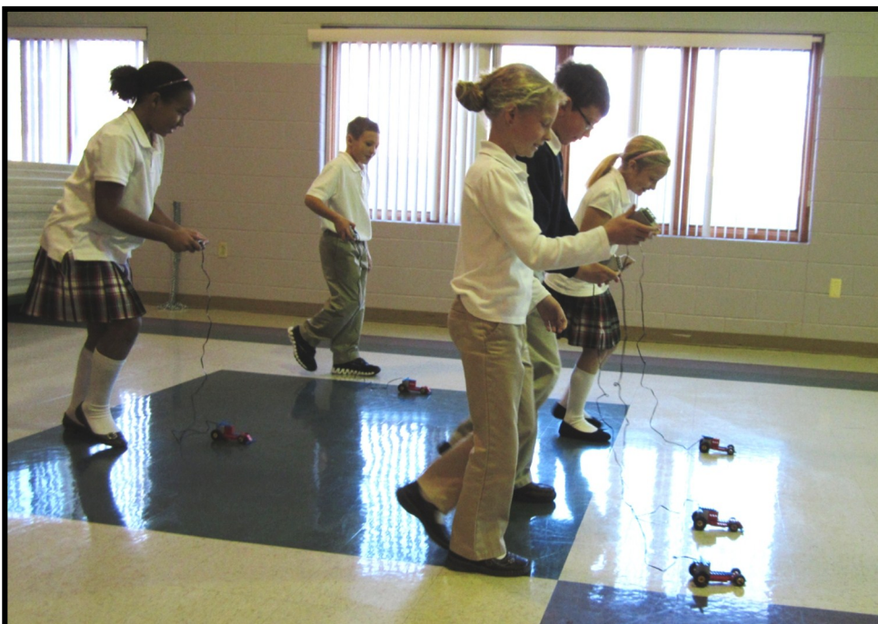
(Left) They're off!

Following the construction of the Lego cars, construction teams had a chance to prove once and for all which car was the fastest at the All Saints Motor Speedway!